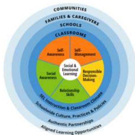
CASEL's SEL Framework (CASEL, 2022)

recommended that schools help children and adolescents with their health and development (UNICEF, 2022). The UNICEF proposal makes sense, as many years are spent in school receiving education. Emotional social learning creates competency in 5 cases: Self-awareness, self-management, social awareness, communication skills and decision-making skills at four levels: Class, school, family and community.